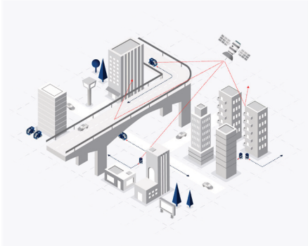
GNSS fails under bridges and near tall buildings